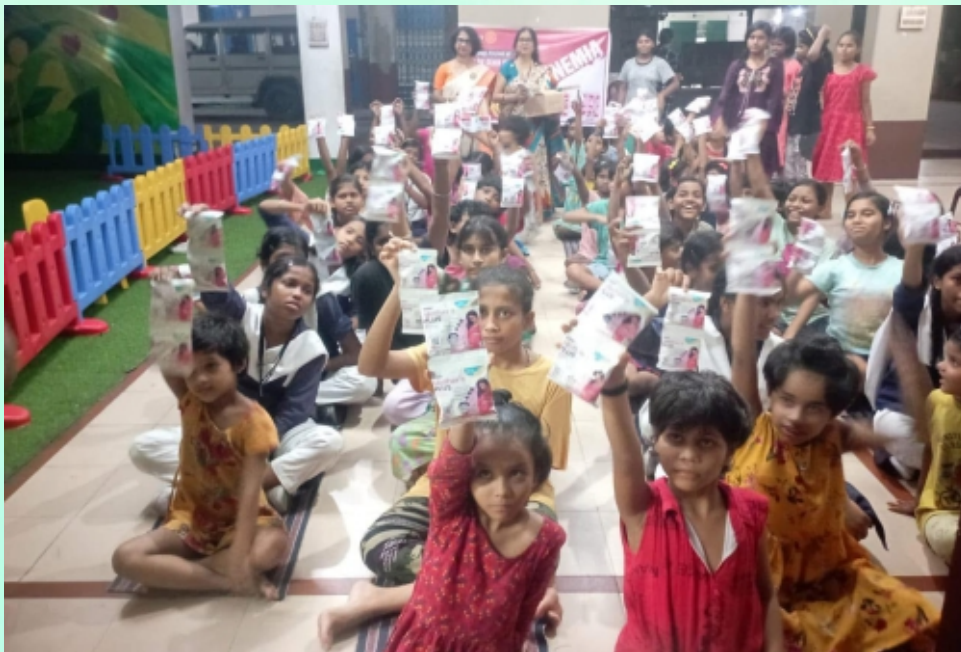
No No Anaemia at Sealdah Loreto School