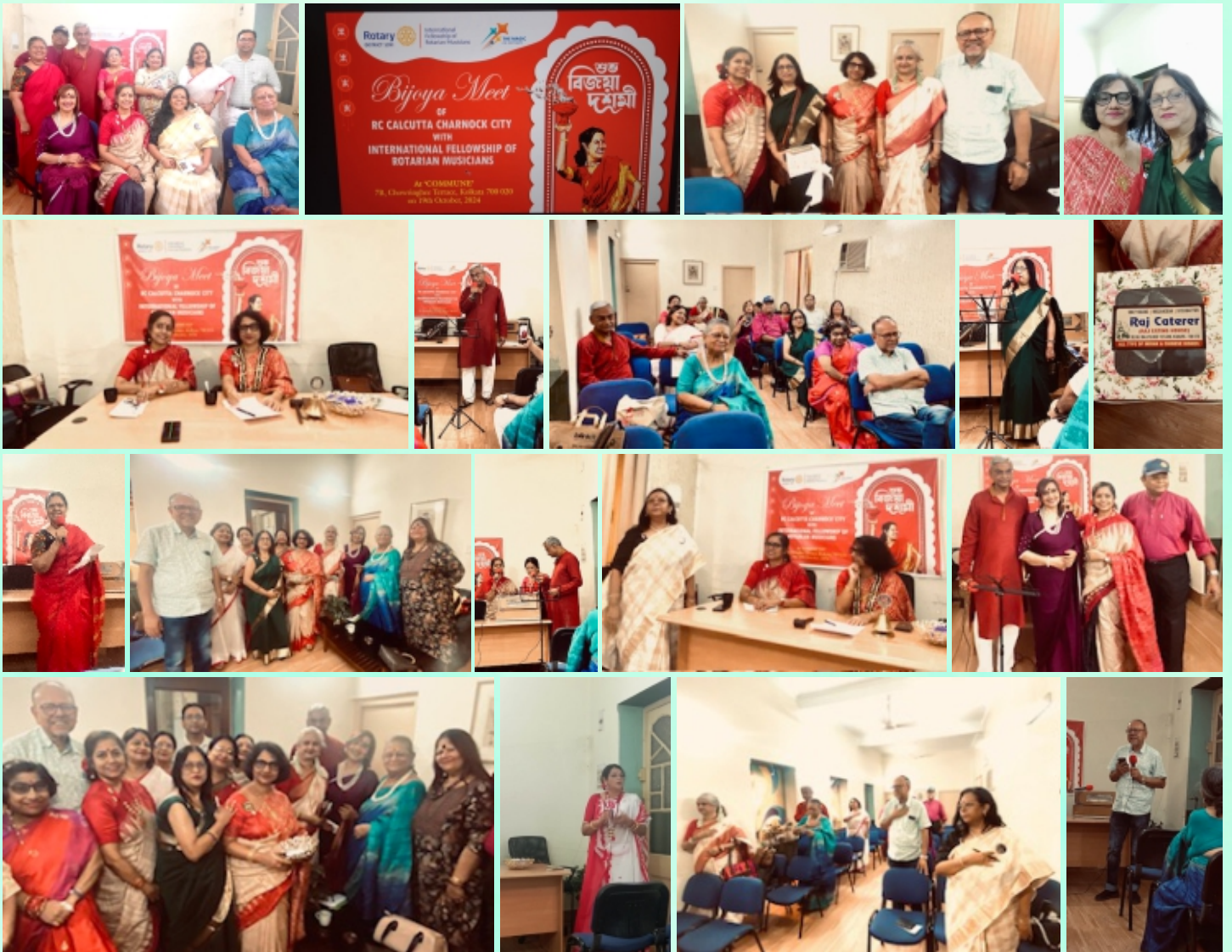
512th Regular Meeting