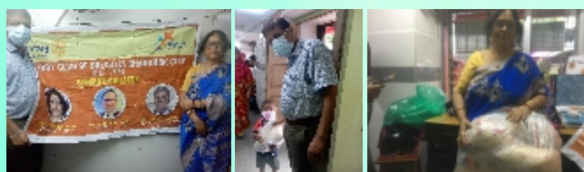
SSKM Monthly Project - September 2024