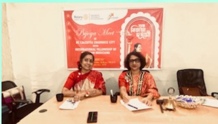
Regular Meeting with IFRM Chair Person