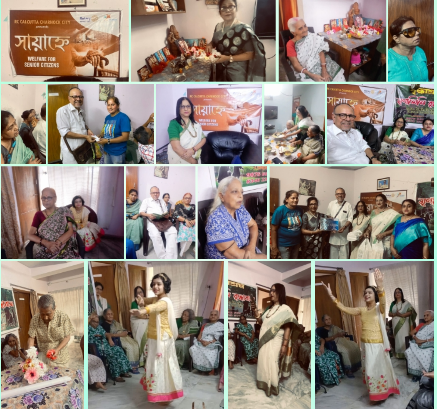
Visit to Old Age Home 'Mrinalini Briddhashram' on 20th October 2024