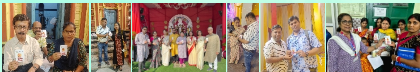
Distribution of 5000 Thalassemia Awareness Card