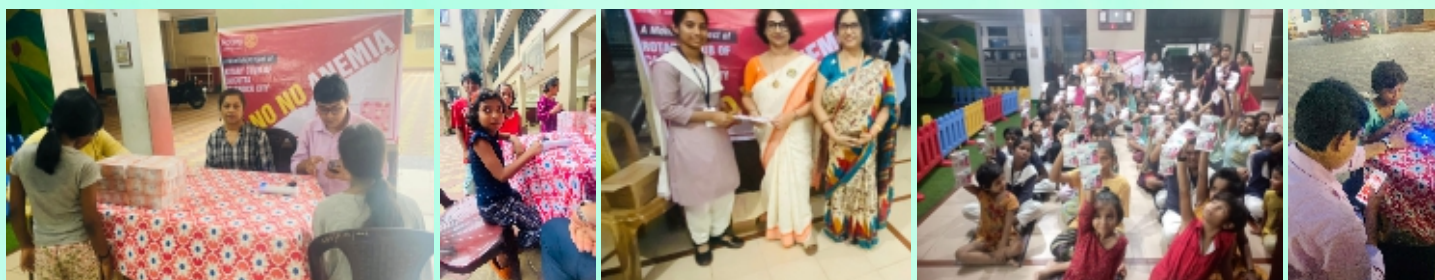
Monthly Project No No Anaemia on 4th October 2024